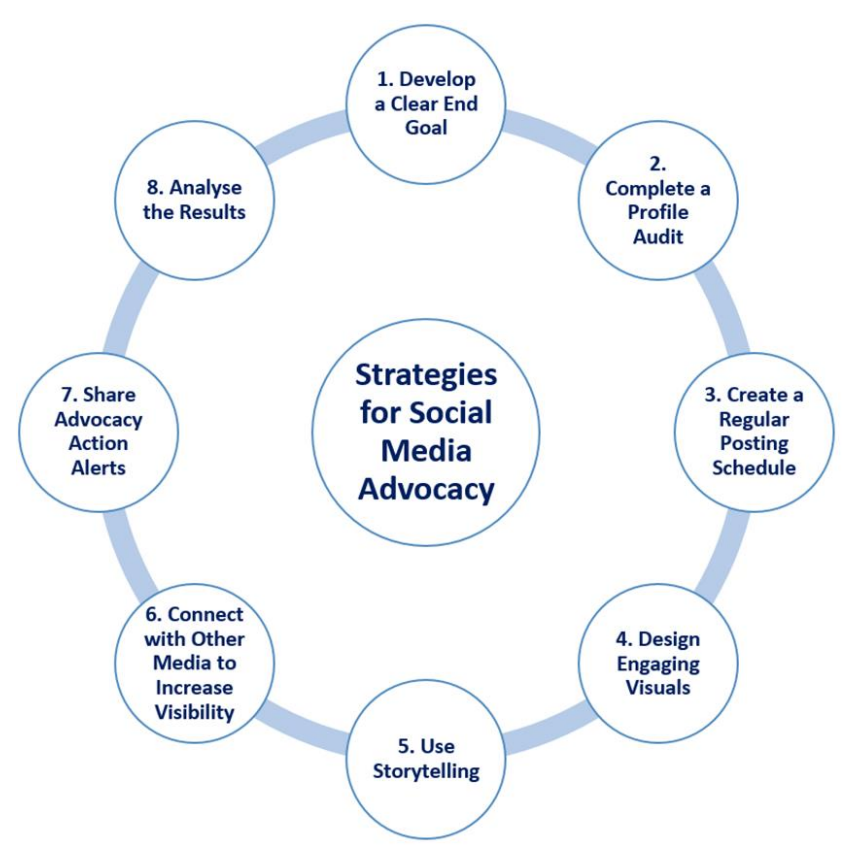
Fig. 5 Eight components for a successful digital advocacy campaign.

A practical guide for a successful strategy for social media advocacy in 8 steps (Vaughn, 2022):