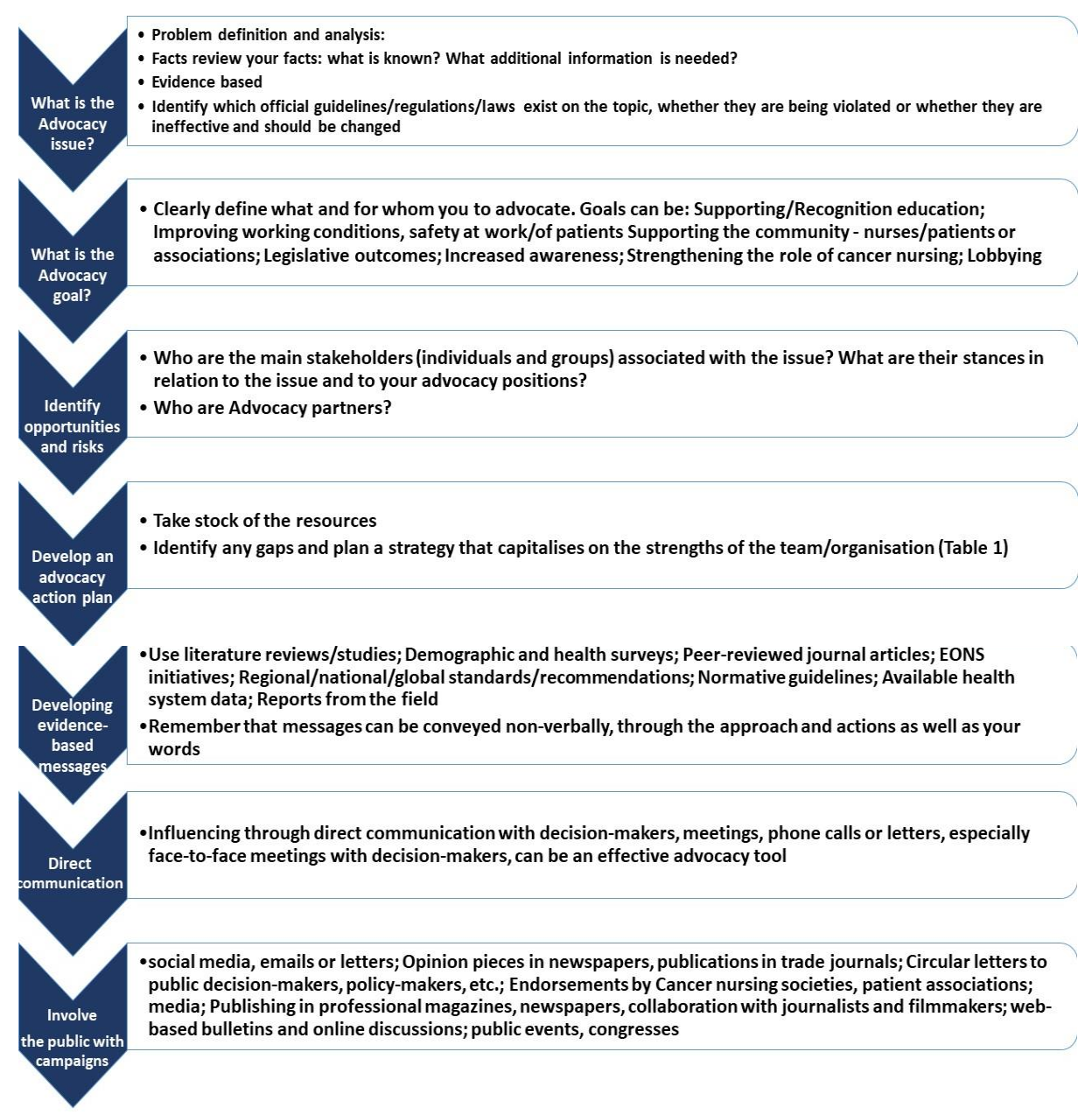
Fig. 5 A step-by-step strategy for advocacy (UNICEF's Advocacy Toolkit, 2010).